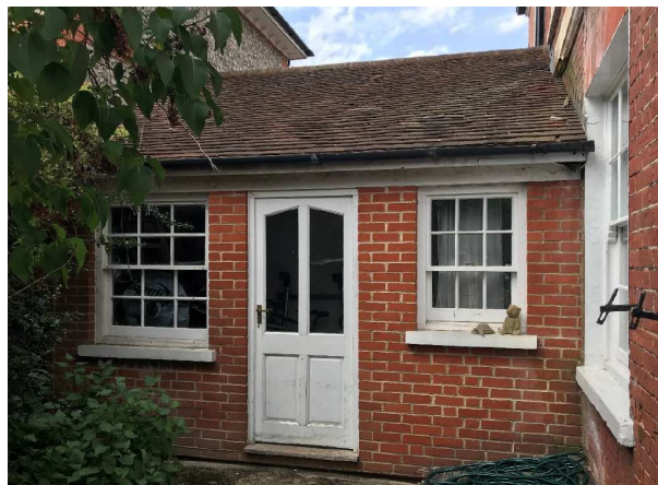
Rear view of utility room at West Streatley House (South Elevation)