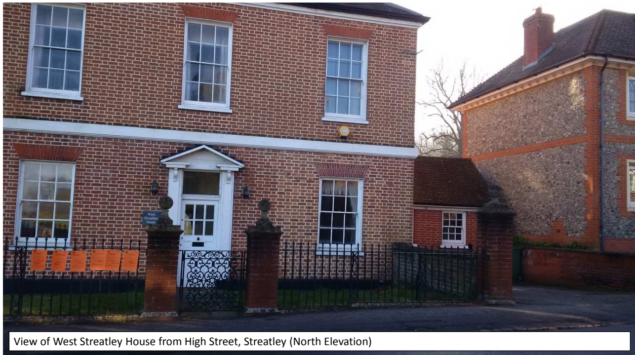
View of West Streatley House from High Street, Streatley (North Elevation)

Photographs for Eastern Area Planning Committee Application 20/01940/LBC2