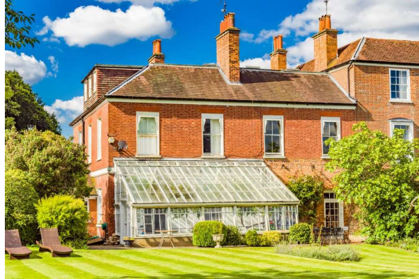
Former rear elevation of West Streatley House before works commenced (South Elevation)