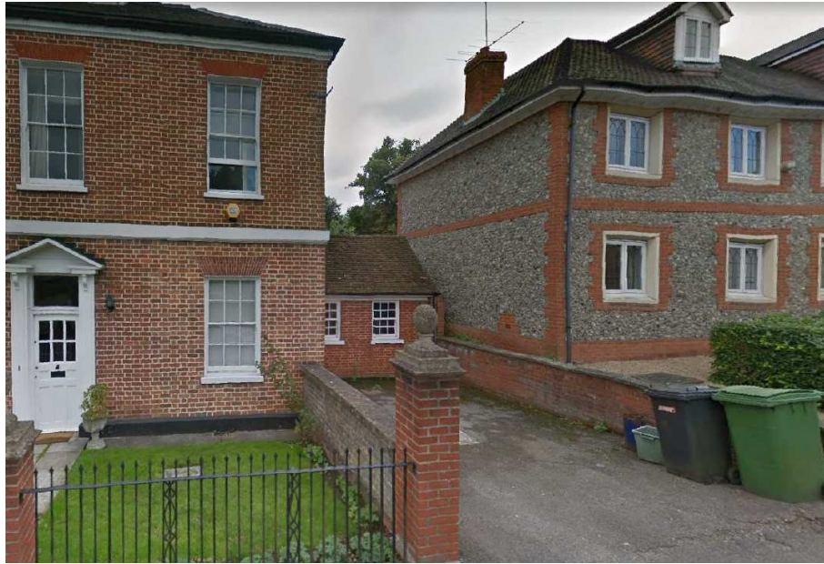
Front view of utility room at West Streatley House (North Elevation)